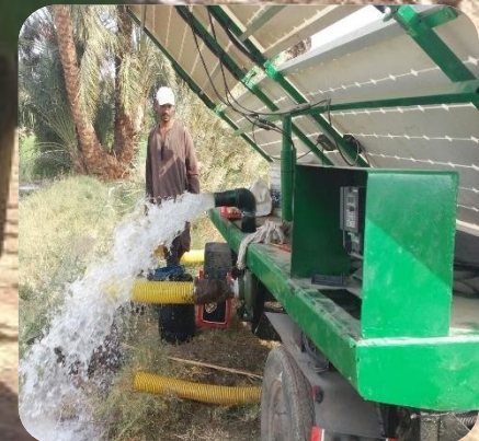
Mobile Solar Water Pump